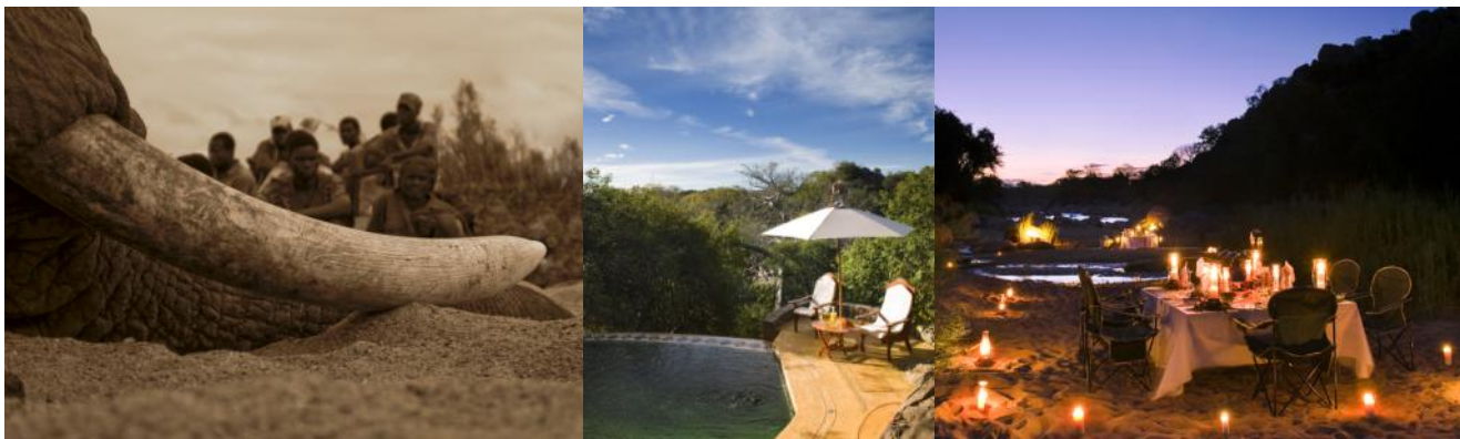
1. People from Mahenye wait for meat from the elephant 2. Swimming Pool at Ingwe Lodge 3. Dinner in the river bed