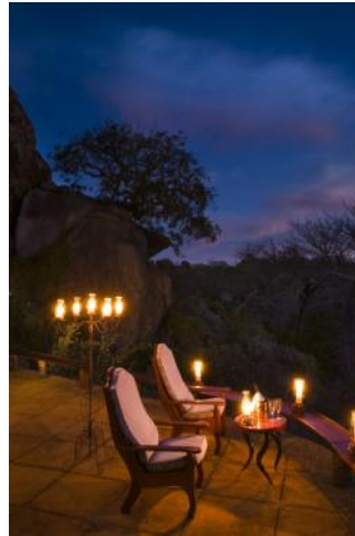
Watching the sun disappear on the deck of the main lodge

The main lodge cascades down from where the vehicles park, through several levels including a