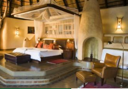
One of the luxurious rooms at Ingwe Safari Lodge

“Ingwe Safari Lodge provides a high level of luxury without losing the feel of being in a truly wild area in Africa..”