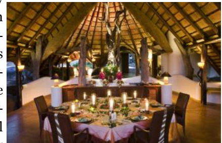
The dining room

Other activities include game drives, horse riding, viewing game from a bunker blind at a water hole or a visit to an African village.